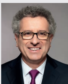
HE Pierre Gramegna Minister of Finance, Grand Duchy of Luxembourg

Ministry of Finance 3, rue de la Congrégation L-2931 Luxembourg www.mf.public.lu